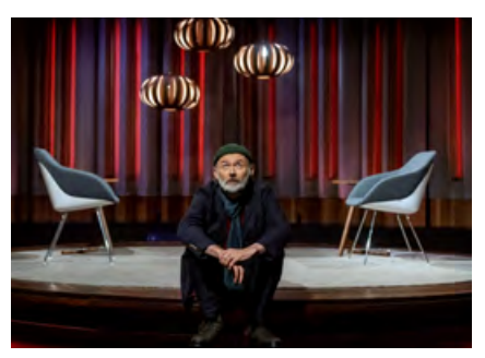
The Tommy Tiernan Show