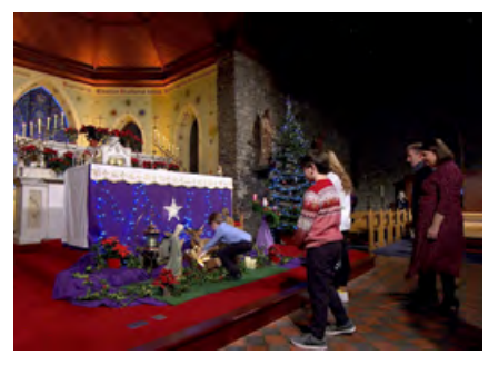
Masses and Services