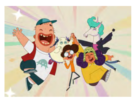
Dorg Van Dango