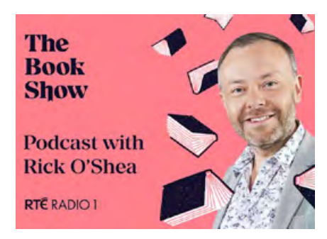
The Book Show

RTÉ Raidió na Gaeltachta commissioned three series from the independent sector in 2020, focusing on the arts and music.