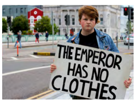
Growing Up at the End of the World