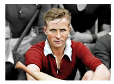
Christy Ring: Man and Ball

Once again, RTÉ commissioned outside broadcast Masses and Services from Kairos Communications; in 2020, with churches shut due to the pandemic, these broadcasts acquired much greater significance. 248,200 (36.1% share) watched Kairos's coverage of the Solemn Liturgy for Good Friday from Christ the King Cathedral, Mullingar, and Midnight Mass from Clonard, Co. Meath on Christmas Eve was shown across Europe via the EBU. As Christmas approached, RTÉ commissioned from Bo Media an additional short programme for Christmas Eve and Day. The Cork Nativity put the 2000-year-old Gospel Nativity story into the mouths of people from all walks of contemporary Cork life.