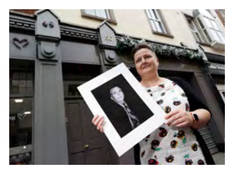
The Francis Street Photographer

Reintroducing animals long extinct in Ireland was the focus of observational series Return of the Wild: Bearman of Buncrana from Moondance Productions, which proved a big hit in the autumn schedule. Returning series Home of the Year from Shinawil and How to be Good with Money from Indiepics completed the line-up on RTÉ One.