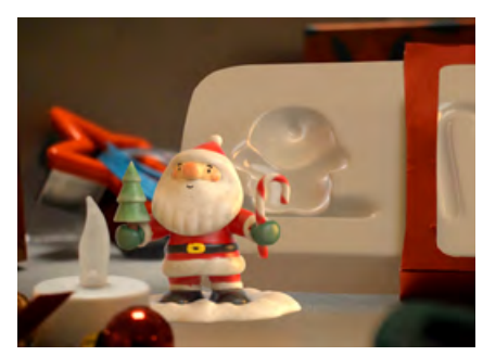
Shorts Yule Love

Our youngest viewers were served up a mix of animation and live action to keep them entertained throughout 2020.