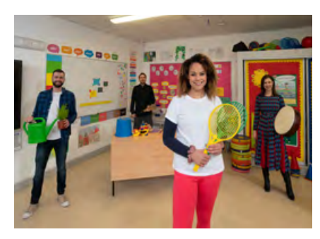
RTÉ's Home School Hub