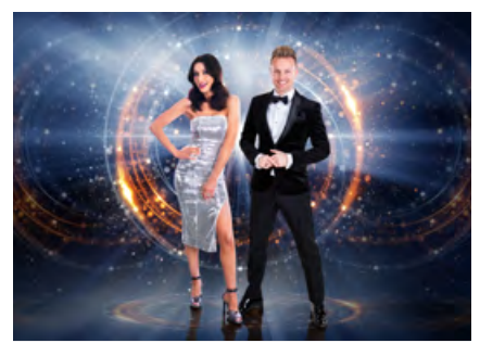
Dancing with the Stars