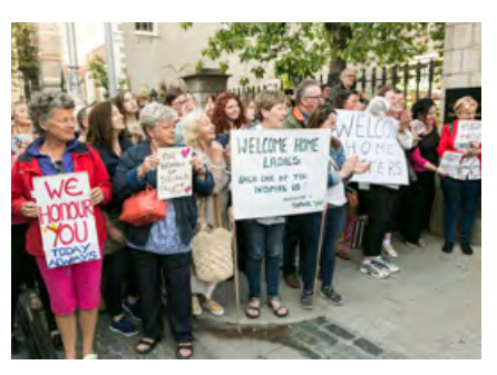
Ireland's Dirty Laundry

Ireland's Dirty Laundry is New Decade TV's two-part telling of the story of the Magdalene Laundries, a co-production with ARTE made with BAI support.