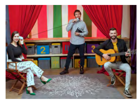
After School Hub