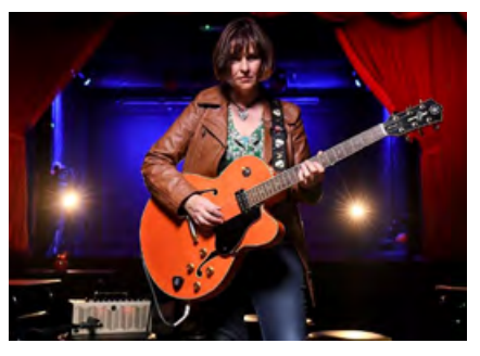
After A Women's Heart

In 2020 RTÉ continued to build considerably on its in-house Cláracha Gaeilge output with a broad range of projects commissioned from the independent sector.