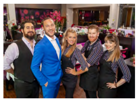
First Dates Ireland

2020 began with a packed schedule of live action and animated content slated for both TRTÉ, our 8–12s content offering and RTÉjr, our pre-school channel.