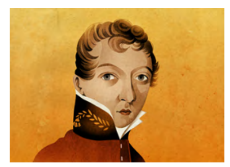
HERSTORY: Ireland's EPIC Women