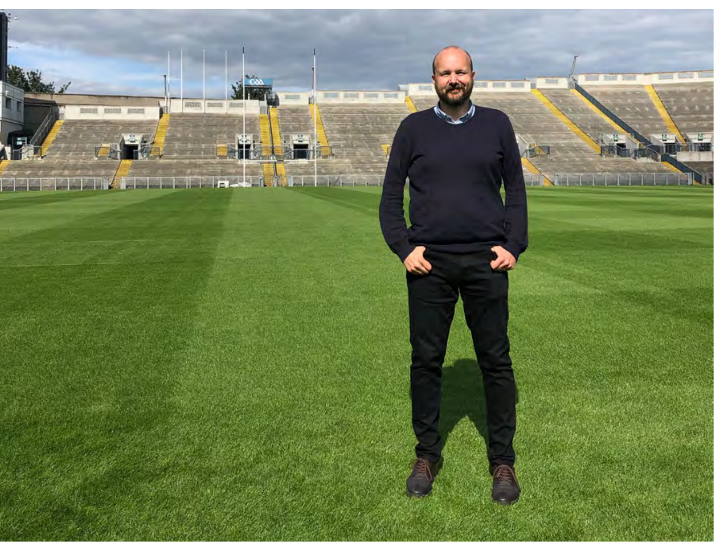
Bloody Sunday, 1920

During the year RTÉ engaged Deloitte to perform specified procedures on the application of specified commissioning procedures to television and radio programme submissions in 2020. Deloitte performed their procedures and was satisfied that, for the sample of items tested, documentary evidence maintained by RTÉ reflected compliance with the relevant commissioning procedures.